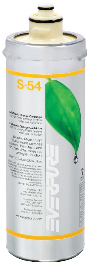
Part No. EV9720-06

The Everpure S-54 Drinking Water System is the practical, low-cost solution for filtering out lead, disinfectant chlorine, dirt, rust, asbestos fibers, microscopic protozoan cysts, and other particles from drinking water, including oxidized iron, manganese and sulfides.